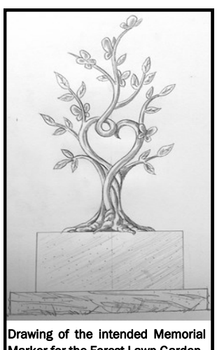
Marker for the Forest Lawn Garden